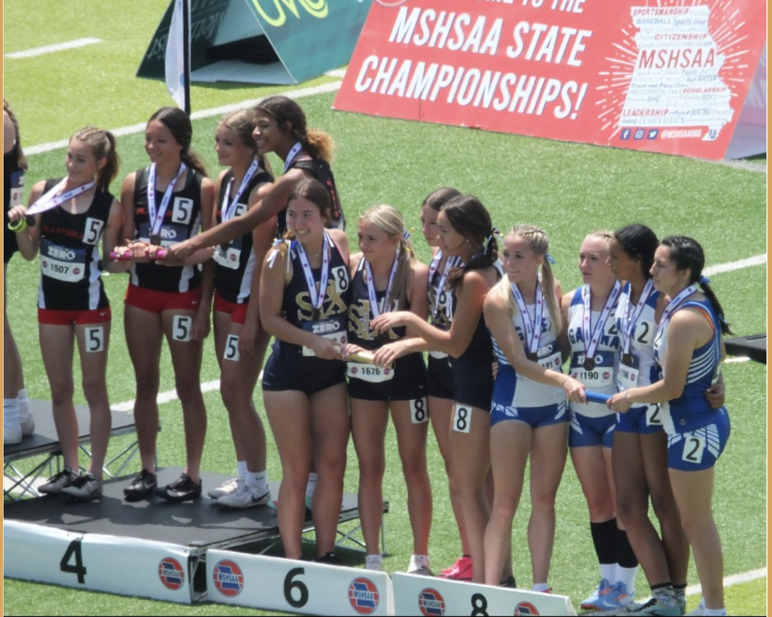
State Golf Athletes