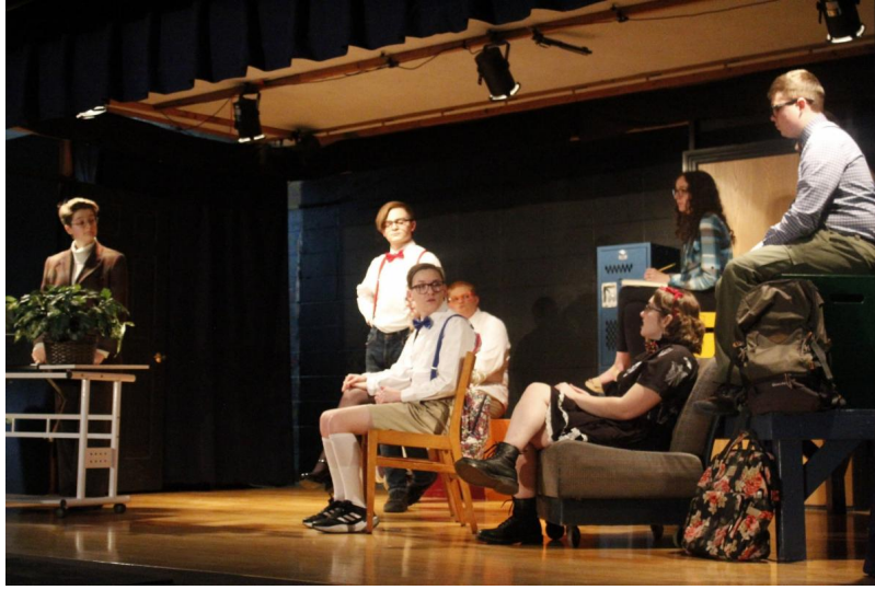
2024 Alumni Trivia Winners